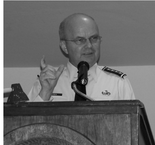
General Mike Hayden Speaks at Army-Navy Club